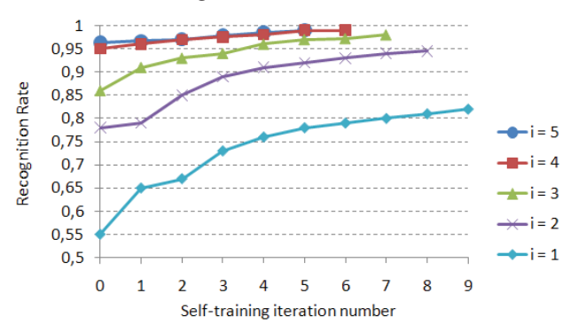
Figure 2. Recognition rate as a function of the number of self-training iterations

images is used for training (55% for i=1 cf. 96% for i=5, without self-training). All profiles are further shown to rise as more training images are acquired through self-training (55% without self-training cf. 82% with 9 iterations, for i=1). Note that the maximum number of self-training iterations decreases with increasing i since there are then fewer unlabelled images available.