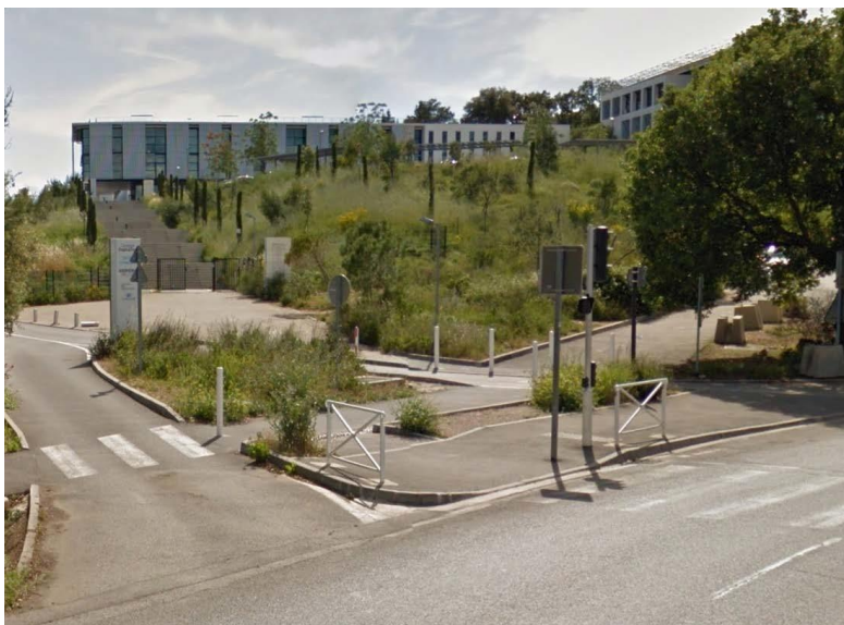
EURECOM is the very last building after climbing the steps.